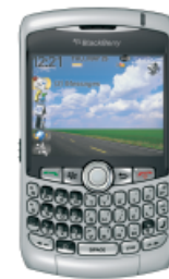
BlackBerry® Curve™ 8320 smartphone

What's more, Mitel is very happy with the service it gets from BT, as Gary concludes: "The BT team provides excellent support, and is very responsive to adds, moves and changes. We've recently renewed our contract, and in the near future we're planning to roll the service out to our mobile engineers."